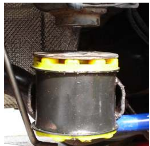
Fig 2. Rear mount - OE washers shown.